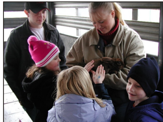
First graders petting the barnyard animals!